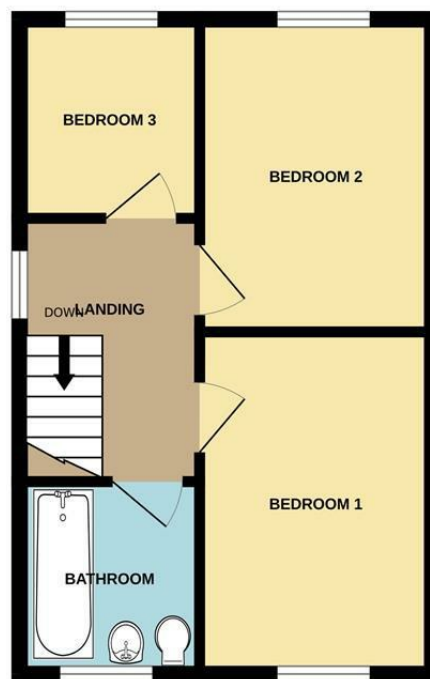
1ST FLOOR 344 sq.ft. (32.0 sq.m.) approx.